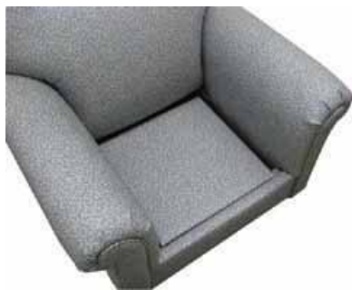
Top View of Clean-out Construction (Loose Seat)

Our unique style offerings are as varied as our customers' needs, requirements and imaginations. Any of our product styles can be easily converted into a Healthcare application. Our HealthCare fabric offerings are extensive. They include Contract Vinyl's with special coatings like PermaBlok, Faux Leathers, Crypton Greens and Hospitality Collection Vinyl's all with very low maintenance.