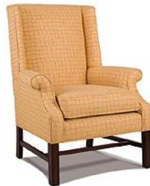
Our HC 743-07 HealthCare Chair